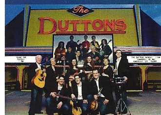
THE DUTTONS SHOW