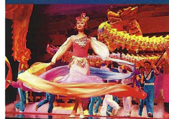
THE ACROBATS OF CHINA