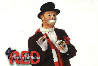
THE RED SKELTON TRIBUTE SHOW