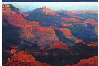
View the spectacular Grand Canyon