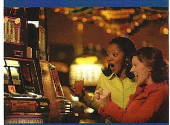
World-class Gaming and Excitement